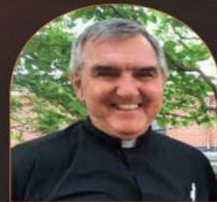
Párroco Emérito, Santo Tomás de Aquino

Escuela Parroquial San Carlos Borromeo 1731 Hulmeville Road, Bensalem, PA